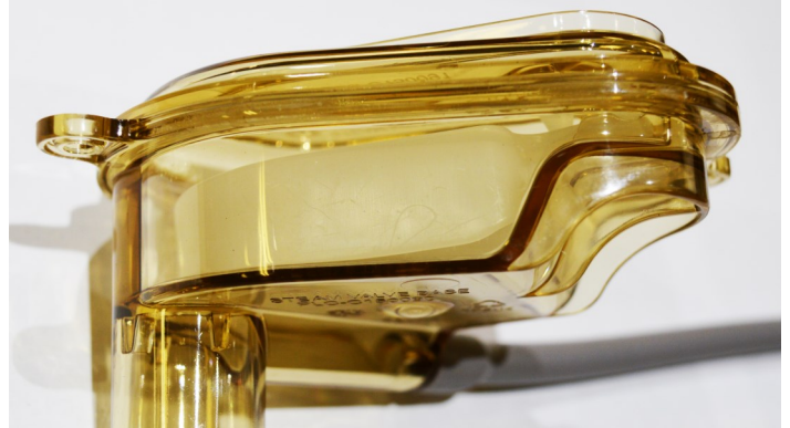
New Style Float