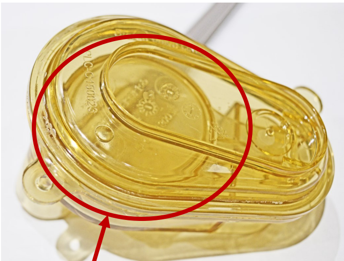
Old Style Float

All new production will use the updated steam valves once the older parts are used up by production. The same will hold true for spare parts. All orders will be fulfilled using the new parts once stock is depleted. A new part number will be utilized at that time.