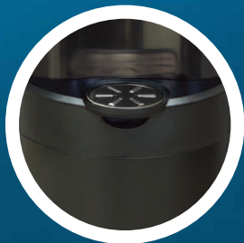
Removable Drip Tray