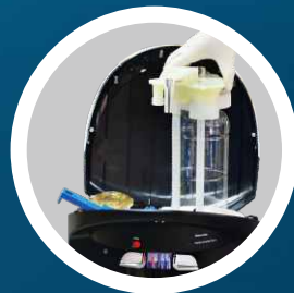
Replaceable Reservoir System SmartFlo™ SF-1 Water Cartridge