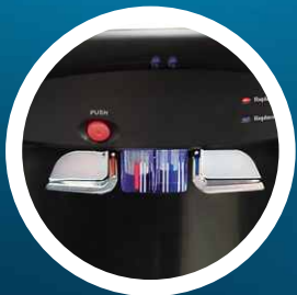
Concealed Water Outlet