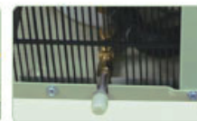
Cold tank drain